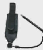
■ 94ACCO133 Hand Strap (Included with purchase)