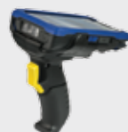
■ 94ACCO170 Pistol-Grip handle