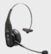
■ 94ACCO127 Bluetooth Headset VXi B350-XT